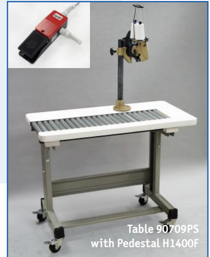
Table 90709PS with Pedestal H1400F

Movable table 90709PS with solid iron frame and formica table board 21¾"x41¾", height 36¾" (55x106cm, 92cm high). The table board is fitted with a roller-type conveyor.