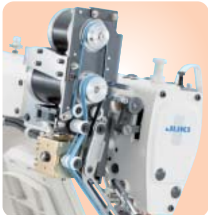
New type belt feed mechanism