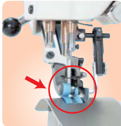
Alternating vertical movement mechanism