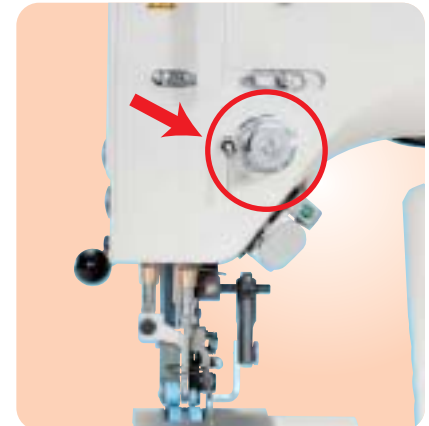
Active tension mechanism