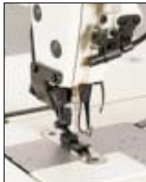
Needle thread clamp mechanism and sliding presser foot