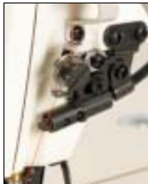
Needle thread draw-out mechanism

The machine comes with a silicon oil lubricating unit, thread spreading mechanism and thread trimming mechanism which trims the thread without fail, thereby consistently ensuring beautifully-finished seams for light- to medium-weight materials. The appearance of the machine is restyled, and it is now colored in a refreshing urban white.